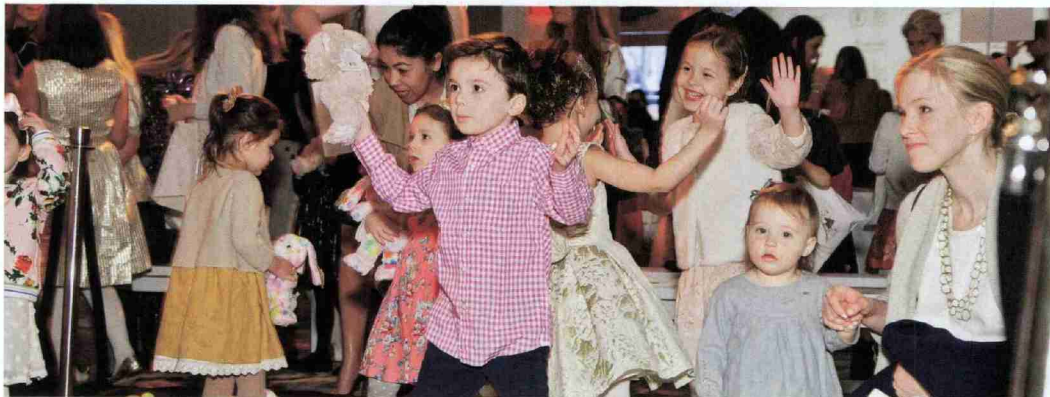
On March 12, the Society of Memorial Sloan Kettering will host its Annual Bunny Hop at 583 Park Avenue at 5 p.m. Bonpoint is the generous sponsor of the event for the fourth consecutive year. For more information, visit society.mskcc.org .

The Fashion Institute of Technology (FIT) will celebrate innovation in sustainability with the 2019 Sustainable Business and Design Conference and Annual Awards Gala. The conference will be held at FIT on Wednesday and Thursday, April 3 and 4; the pinnacle Annual Awards Gala will be held on the evening of Wednesday, April 3, at the American Museum of Natural History. This is the first year FIT will bring these two signature events together. For more information, visit fitnyc.edu .