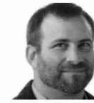
Joshua Berman is the author of "Colorado Camping." Find him at

These were the tales that accompanied us as we topped 9,938-foot Cuchara Pass and continued down the road.