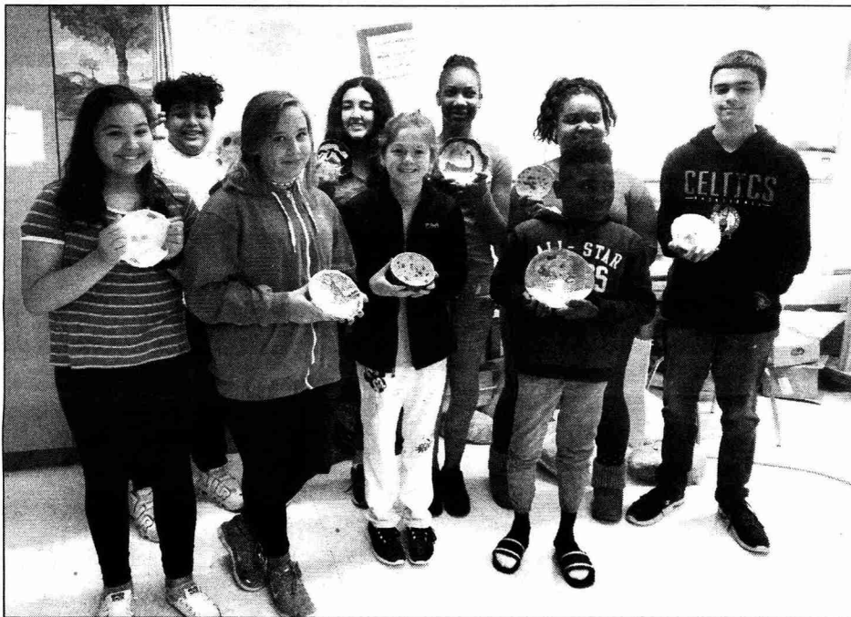
Monomoy Regional Middle School students display soup bowls they created for the May 1 fundraiser.