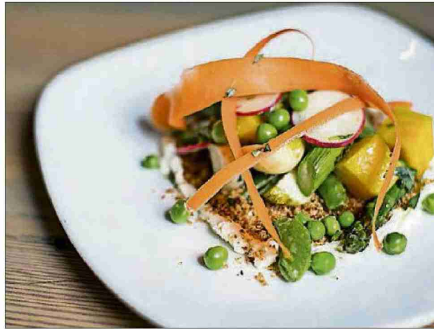
Miller Union will celebrate its 10th anniversary in November.

Noon Nov. 13. $25. Marcus Jewish Community Center of Atlanta, 5342 Tilly Mill Road, Atlanta. bit.ly/2JdjG0m