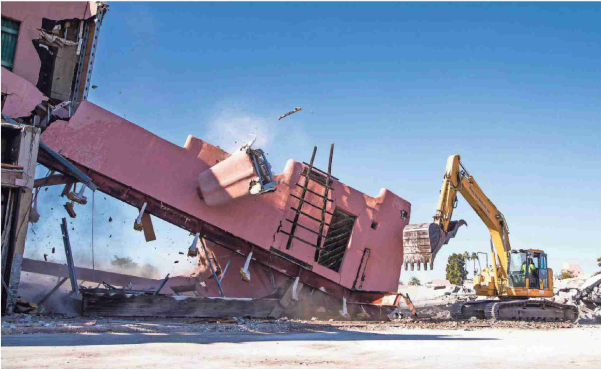
The Papago Plaza in Scottsdale is being demolished. Workers tear down parts of the buildings, Thursday. The shopping center, Scottsdale's oldest, is being replaced with a contemporary mixed-use development.