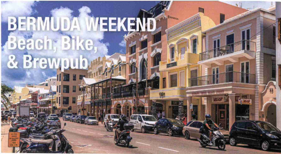
Hamilton, Bermuda's capital.

BERMUDA packs a whole lot of fun into a relatively small island; three days might not be long enough to see it all, but here's how to hit the highlights of this perfect long-weekend getaway destination from the East Coast.