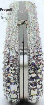
Fregoli clutch, fregoli.net