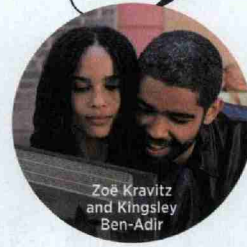
Zoë Kravitz and Kingsley Ben-Adir