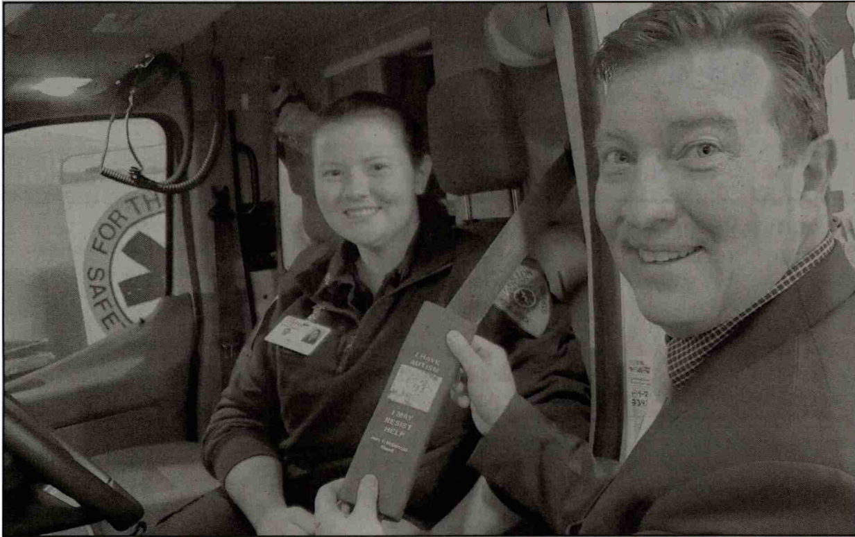
Norfolk Sheriff Jerry McDermott displays an autism awareness seatbelt cover.