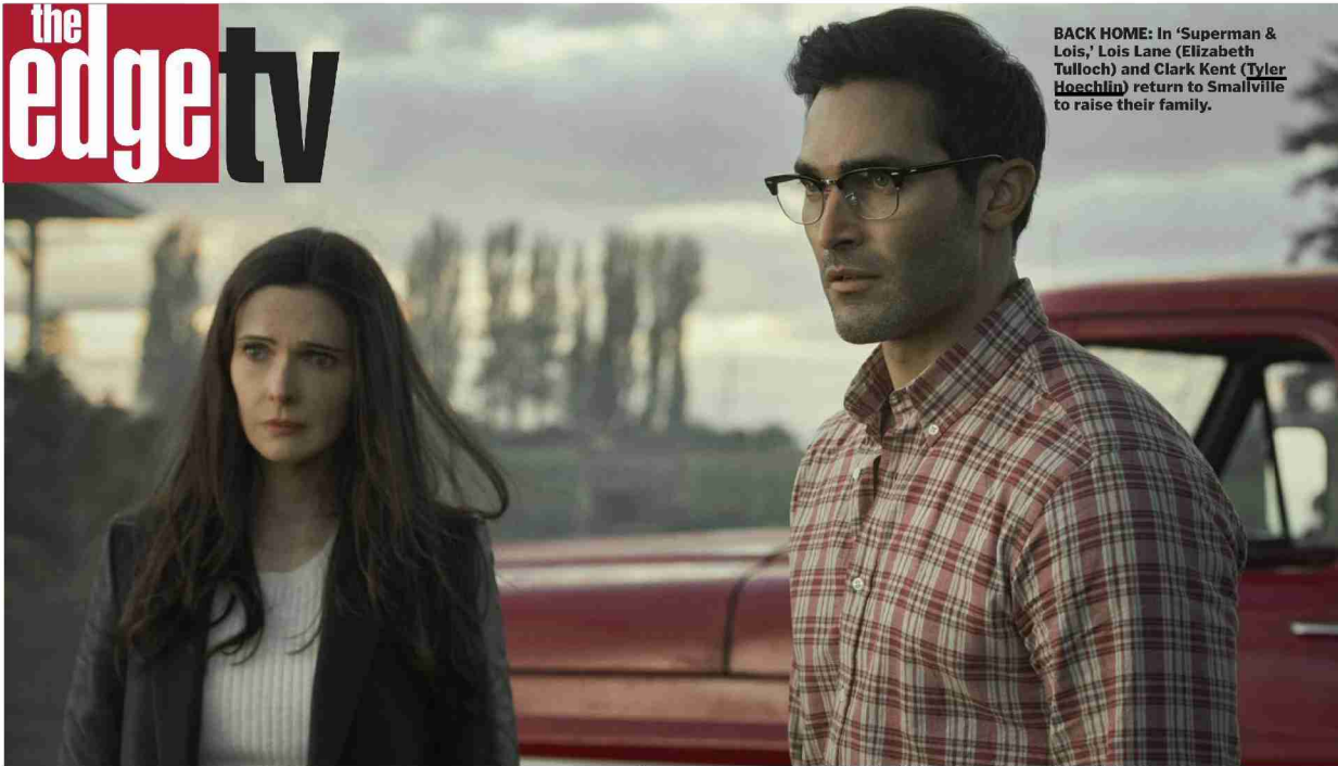
BACK HOME: In 'Superman & Lois,' Lois Lane (Elizabeth Tulloch) and Clark Kent (Tyler Hoechlin) return to Smallville to raise their family.