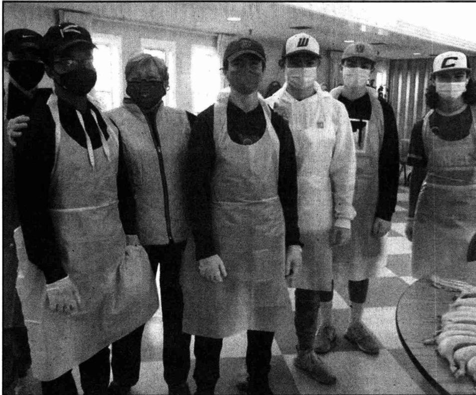
MOST BLESSED SACRAMENT COMMUNITY DINNER MINISTRY volunteers are preparing to host a Prom inspired Grab & Go Meal community dinner.