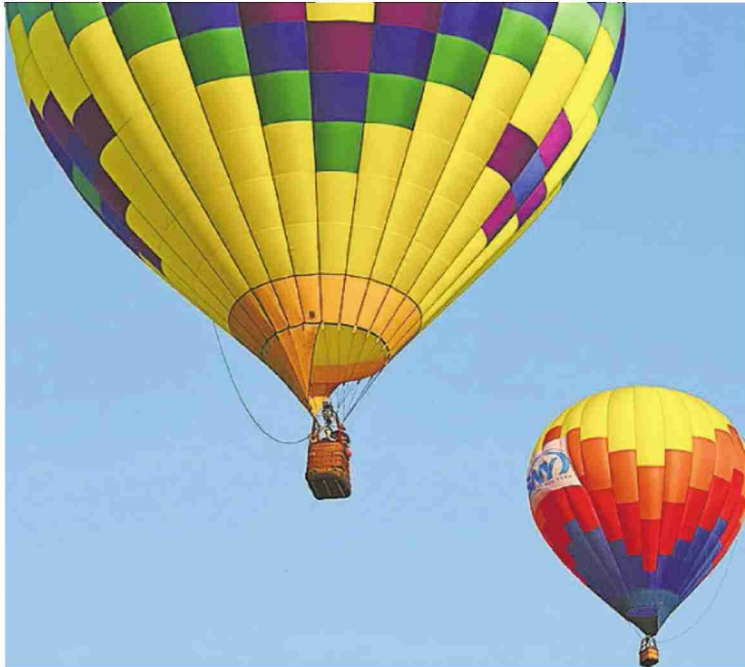
The 38th annual New Jersey Lottery Festival of Ballooning will be held today through Sunday.

In addition to the New Jersey Lottery hot air balloon, other new special balloons include a giant sloth and a colorful unicorn.