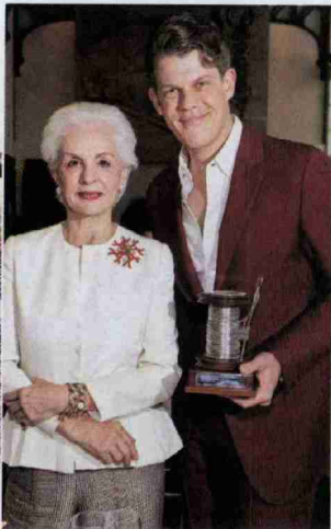
Carolina Herrera and Wes Gordon